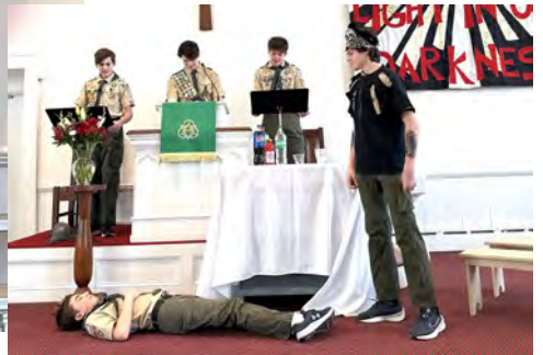
SCOUT SUNDAY 2025